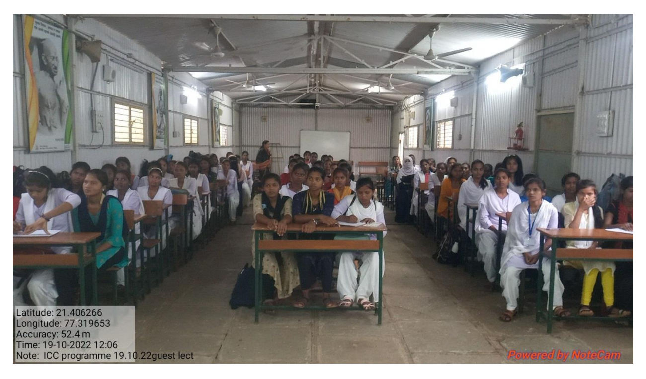
Students listening the lecture on Hygine and safety for girls.