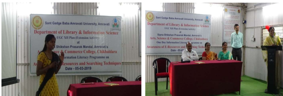
(Feedback and Closing Session)